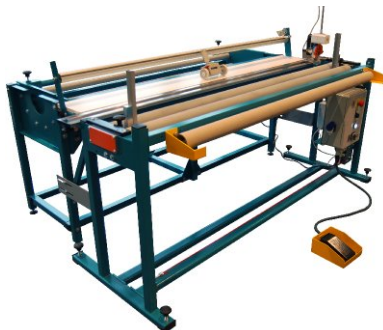
wersja z NT-1/L oraz OT-1/R version with NT-1/L and OT-1/R версия с NT-1/L и OT-1/R